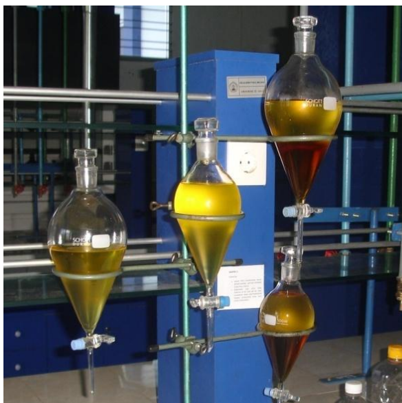
Figure 1. Separation of FAME – Glycerin using funnels

After heating, the mixture was allowed to cool naturally. The mixture became produce two layers with lower layer darker than the upper one. The darker layer was by product known as glycerin or glycerol. Glycerin is a compound that dissolves in water. It has an economic value because it can be used as raw material for several industries such as cosmetics, explosives, and plastics. Later, by product was decanted by means of a separating funnel [10]. The clear liquid left in the funnel was the main product, FAME or biodiesel. The product was washed by pouring 50 ml hot water two times in order removes any left glycerin, since glycerin is soluble in water while FAME is not.